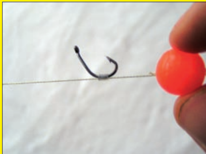
5. Slide a small piece of rig tube on the rig link and slide it over the point of the hook towards shown position