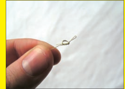
4. Tie a little hair loop on the stripped side and rig a pop-up on the hair