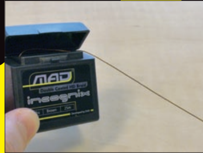
2. Cut a piece of IncogniX that is sufficient for this rig (about 30 cm)