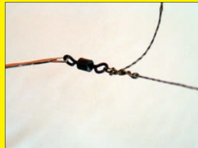
9. Now finish the rig by tying a swivel on the end with a grinner knot