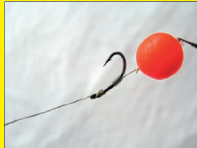
6. Tie a knotless knot to fix the hook and make sure that the main rig line comes out of the eye of the hook on the side of the point