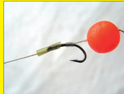
7. Slide a piece of shrink tube over the hookshank and bend it in a nice line aligner shape with steam