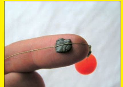
8. Place a piece of tungsten paste on the rig at the point where you want it to stay at the bottom