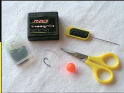
1. Most important components for this rig are IncogniX hooklink, shrink tube, rig tube and tungsten paste